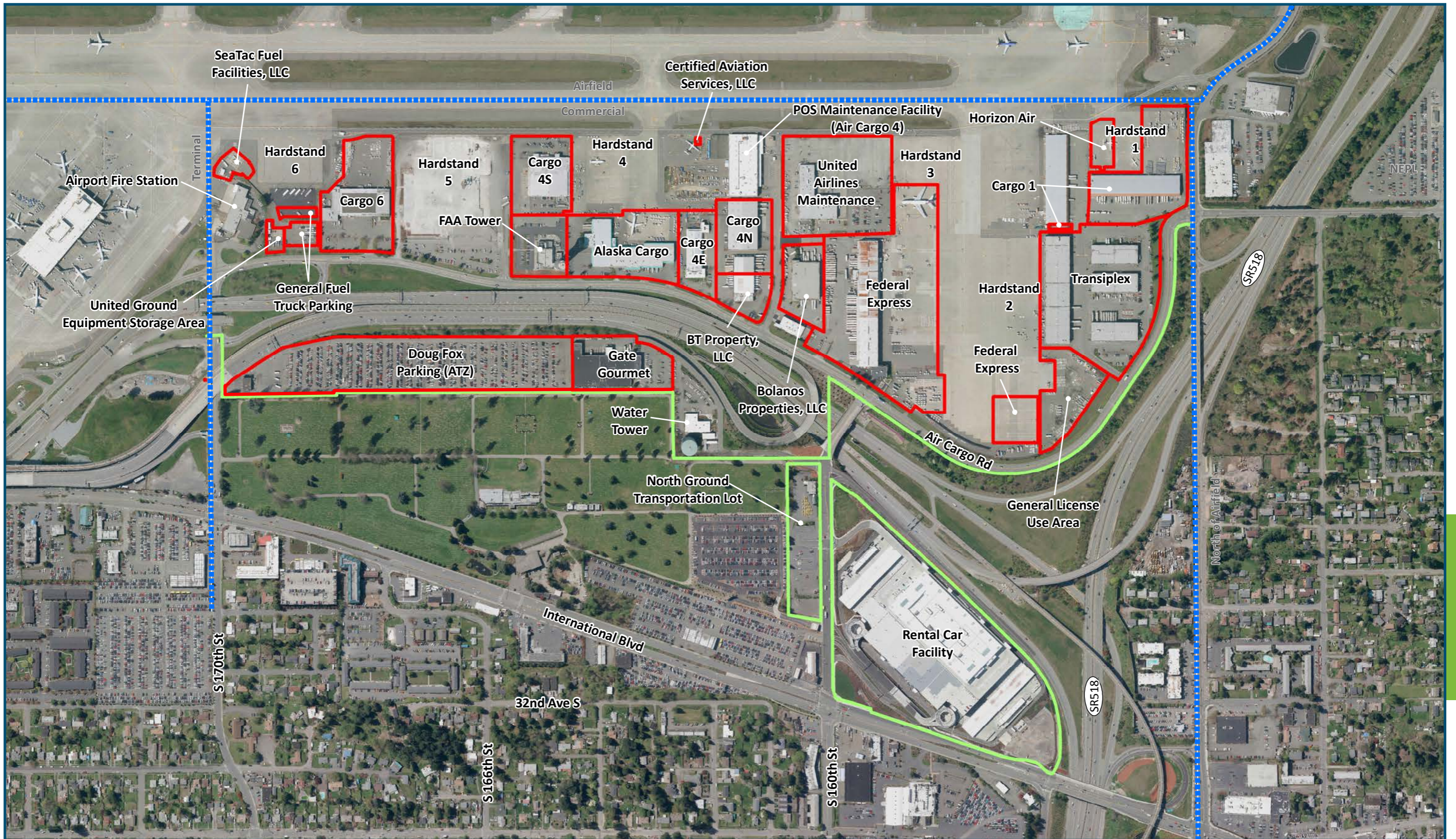
Aerial Photo Taken Spring 2012